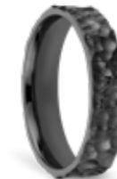
568-80-X2 Innenring | Inner ring

€30,- | £30,- | $30,- DKK 250,- | SEK/NOK 329,-