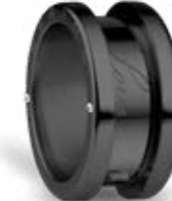
520-110-X4 Außenring | Outer ring

€30,- | £30,- | $30,- DKK 250,- | SEK/NOK 329,-