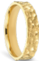
568-20-X2 Innenring | Inner ring

€40,- | £40,- | $50,- DKK 299,- | SEK/NOK 449,-