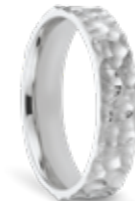
568-10-X2 Innenring | Inner ring

€30,- | £30,- | $30,- DKK 250,- | SEK/NOK 329,-