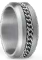
534-11-X3 Einzelring | Single ring

€39,90 | £39,- | $49,- DKK 299,- | SEK/NOK 449,-